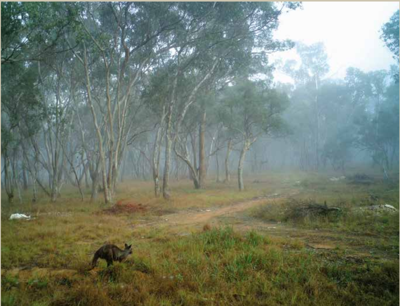
Photograph taken at one of the illegal dumping sites

Pictures taken from the cameras have also identified some interesting activity from local wildlife.